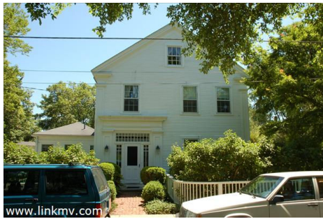
Main House Front View