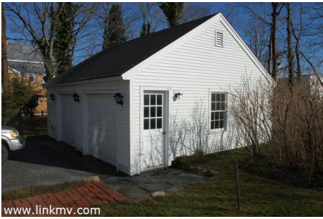
Main House Garage