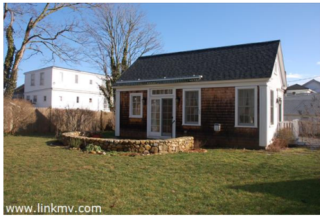
Guest House Side Door