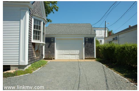
Guest House Garage