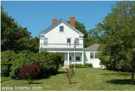
Main House Rear View