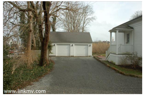
Main House Garage