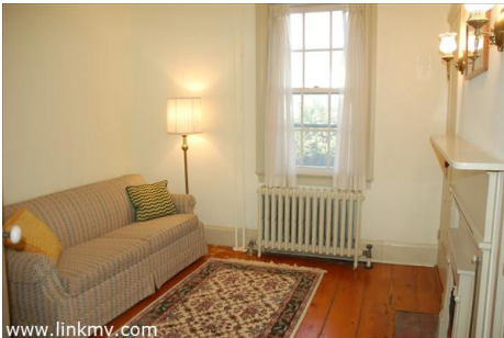
Bedroom or Den 1st floor