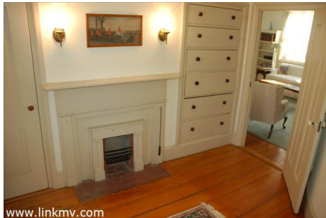
Bedroom or Den 1st floor