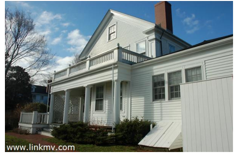
Main House Back Porch