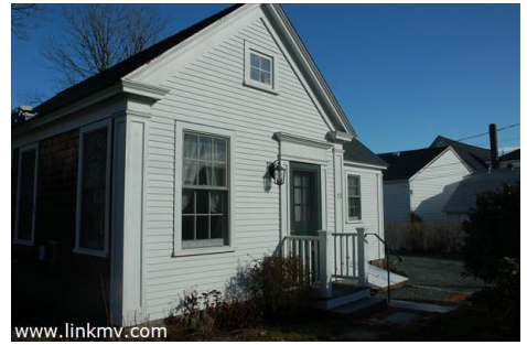
Guest House Front Door