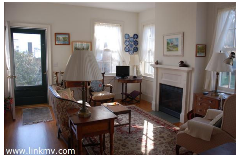
Guest House Sitting Area