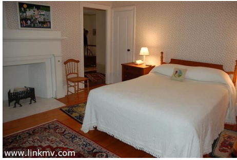
Master Bedroom 2nd floor