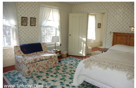
Front Bedroom 2nd floor