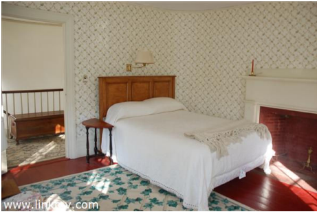
Front Bedroom 2nd floor