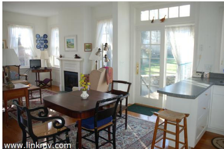
Guest House Slider to Patio