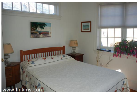
Guest House Bedroom