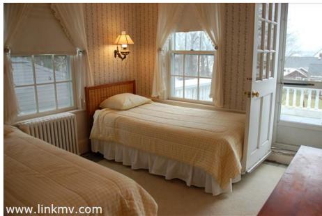
Back Bedroom 2nd floor