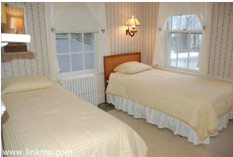
Back Bedroom 2nd floor