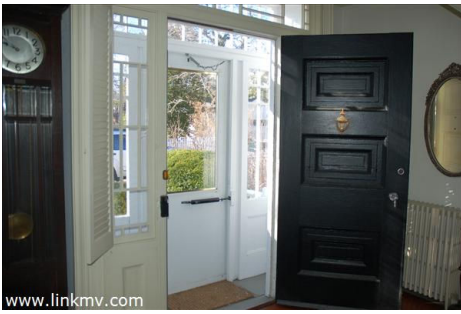
Unusual Double Door Entry