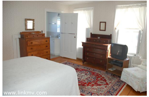
Master Bedroom 2nd floor