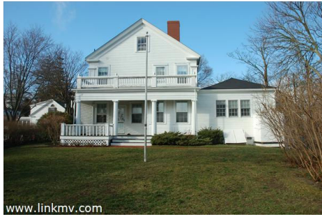
Main House Rear View