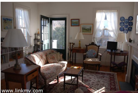
Guest House Sitting Area