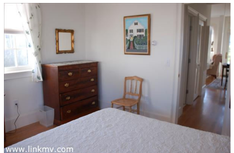
Guest House Bedroom