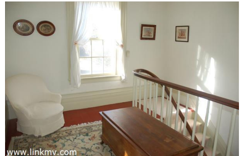
Landing 2nd floor