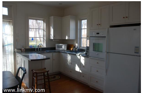
Guest House Kitchen