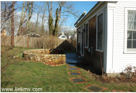
Guest House Patio