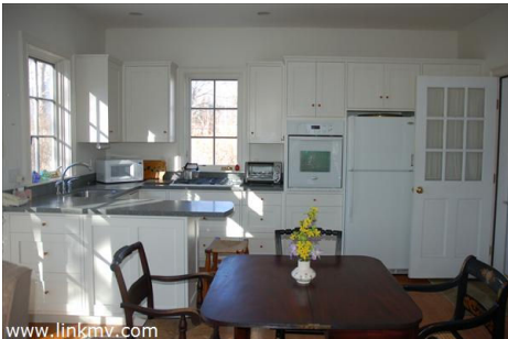
Guest House Kitchen/Dining