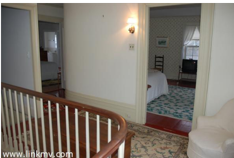
Landing 2nd floor