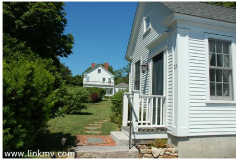
Guest House Front Door