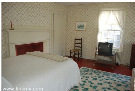
Front Bedroom 2nd floor