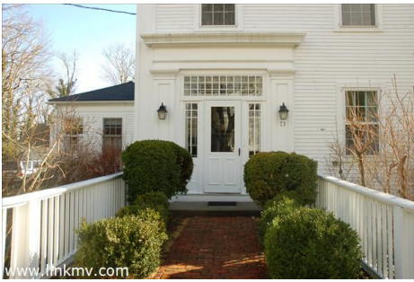
Main House Front Door